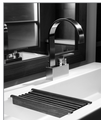
Teak Sink Tray (TK-METD) $118

MTI uses only 100% U.S.-certified legal, reclaimed, sustainable teak. A replacement tree is planted 20 years before a tree is harvested. The teak used in MTI products is imported from reputable suppliers bordering Burma (Myanmar), hence the name Burmese teak. MTI suppliers observe all international laws regarding labor and conservation. All of the Burmese teak used by MTI is harvested from reclaimed forests and is absolutely not endangering or depleting rain forests.