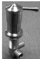
For tubs. 10 GPM

This Breda is used with Fill-Flush when an additional filling device is desired such as a hand-held shower, overhead shower or any other single device. In this application, the handle is turned to divert water from filling the bath through the jets to another device.