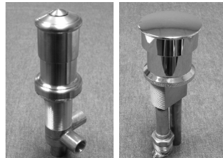
For Gentle Ped. 10 GPM