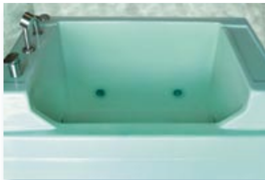
JENTLE PET® spa for dogs in seafoam green.

The image featured in this release is available in high resolution format.